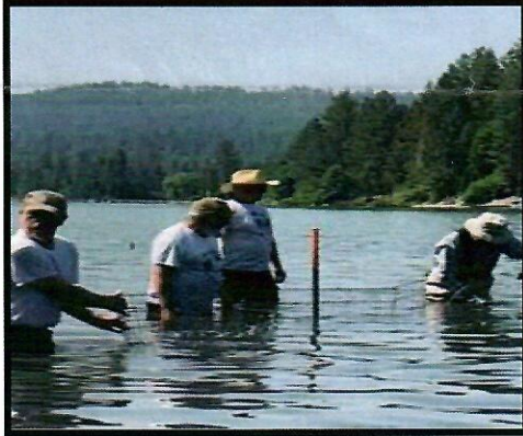
Volunteers making a difference.